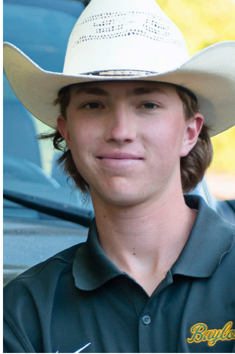
Henry Graham Otis Lowe Memorial Scholarship