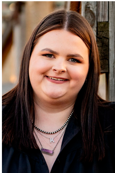
Kate Smith Youth Fair of Rockwall Scholarship