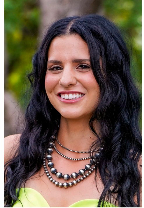
Avery McInvale Youth Fair of Rockwall Scholarship