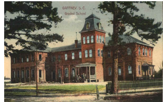
Original Central School Building, c. 1900