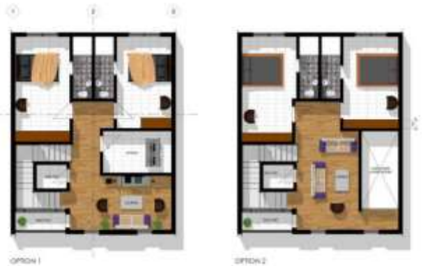
FLOOR PLANS – FIRST FLOOR – 102.6 sqm