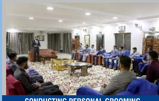
CONDUCTING PERSONAL GROOMING PROGRAMME OF CLASS XII