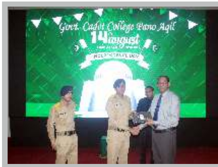
PRINCIPAL CCPA, COL SAADATULLAH (R) DISTRIBUTING AWARDS DURING INDEPENDENCE DAY