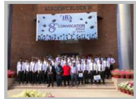
CADETS OF CLASS XII DURING VISIT OF IBA UNIVERSITY SUKKUR