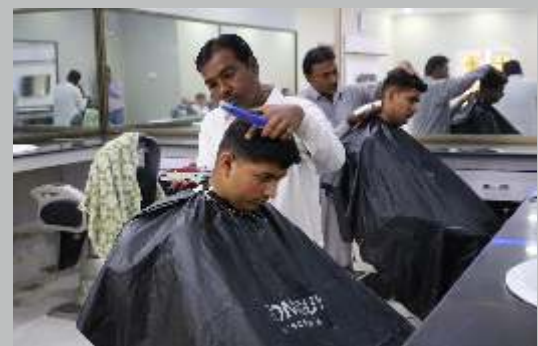
NEAT AND HYGIENIC BARBER SHOP