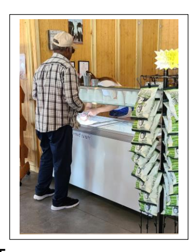
COUNTY LINE MARKET