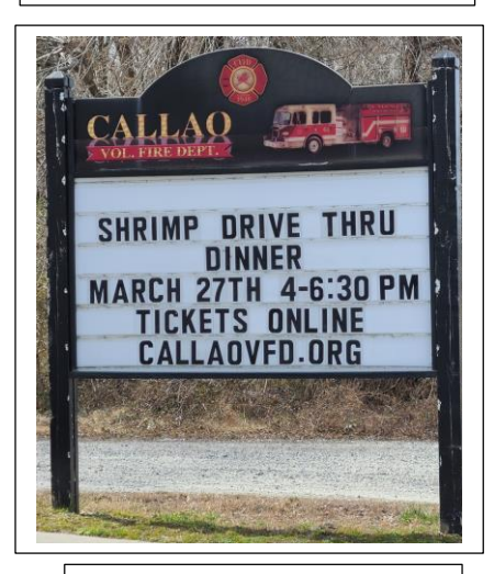
CVFD to have Shrimp Drive Thru Dinner

CHCA greatly appreciates all who assists in any way to support our efforts to make Callao a better place to live and do business. We would love to hear your feedback. Check us out on Facebook. Anyone wishing to make a contribution, please send to CHCA, PO Box 17, Callao, VA 22435 (and soon our website.)