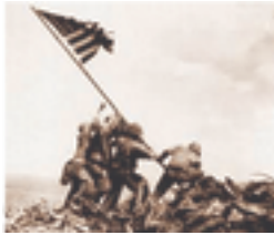
God Bless America And Our Troops