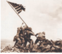
God Bless America And Our Troops