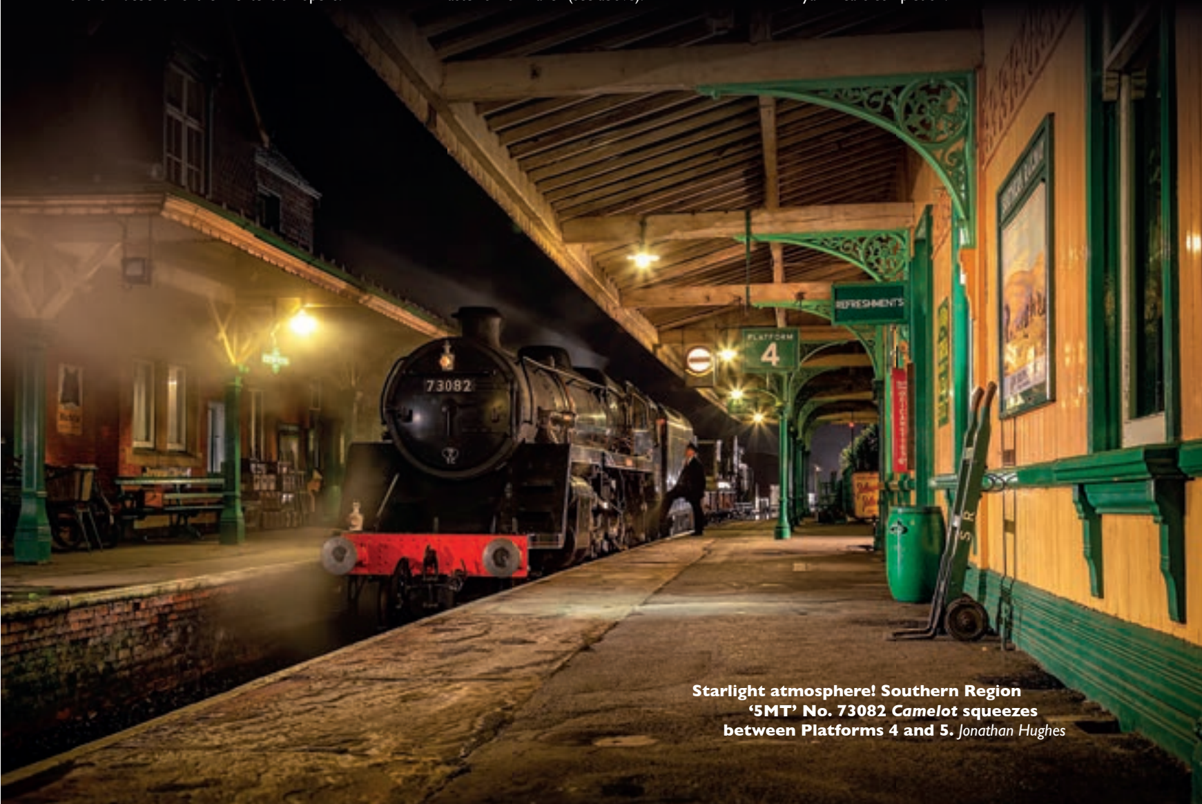
Starlight atmosphere! Southern Region '5MT' No. 73082 Camelot squeezes between Platforms 4 and 5. Jonathan Hughes

2021: A third and major extension to the Bluebell's carriage shed and workshops on the former goods yard nears completion.