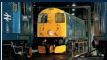
SHEDMASTER 21st Century Roundhouse