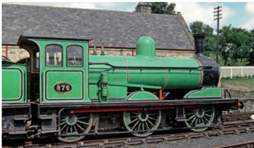
Preservation past and future. A 1995 view of Beamish's Rowley station with No. 876 wearing a variant of the NER livery it will carry after 2022.