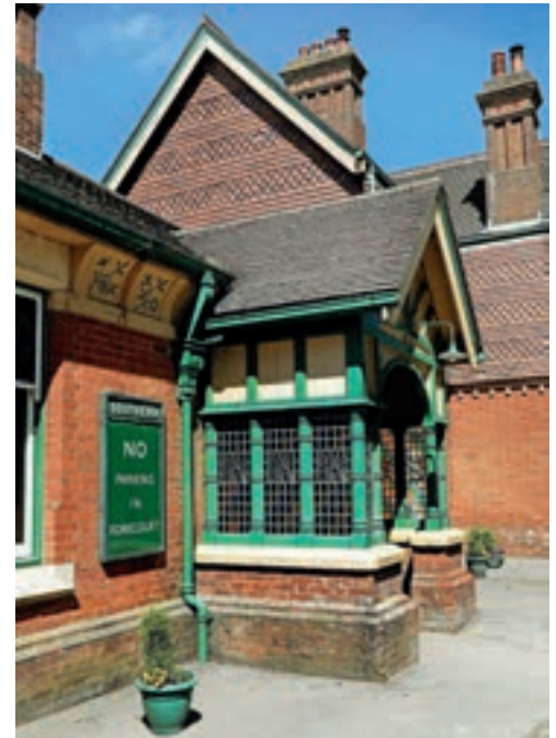
...but happily this striking feature was practical to restore, replicated using the surviving porch at Mayfield. Note the original floral patterned stone coving, picked out in green.

A restoration gang made up of members who have 'aged out' from our junior '9F Club' have made a great start on the wagon fleet. Coupled