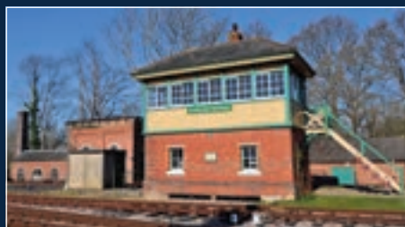
HORSTED NEEDS HELP! Repairs will cost £1.8m