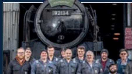
FOR THE PEOPLE The 'Moors Line' family