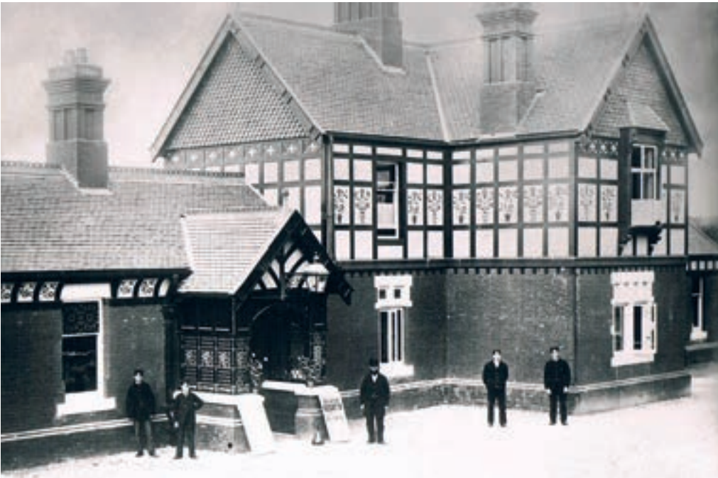
The station when new in 1882, complete with painted decorative upper panels and leaded stained-glass porch – replaced with tongue and groove wood in 1914. The decorative plaster work to the first floor of the station house was replaced even in LBSCR days with a continuation of hanging tiles in the Sussex style. It would not be cost-effective to return to this appearance...