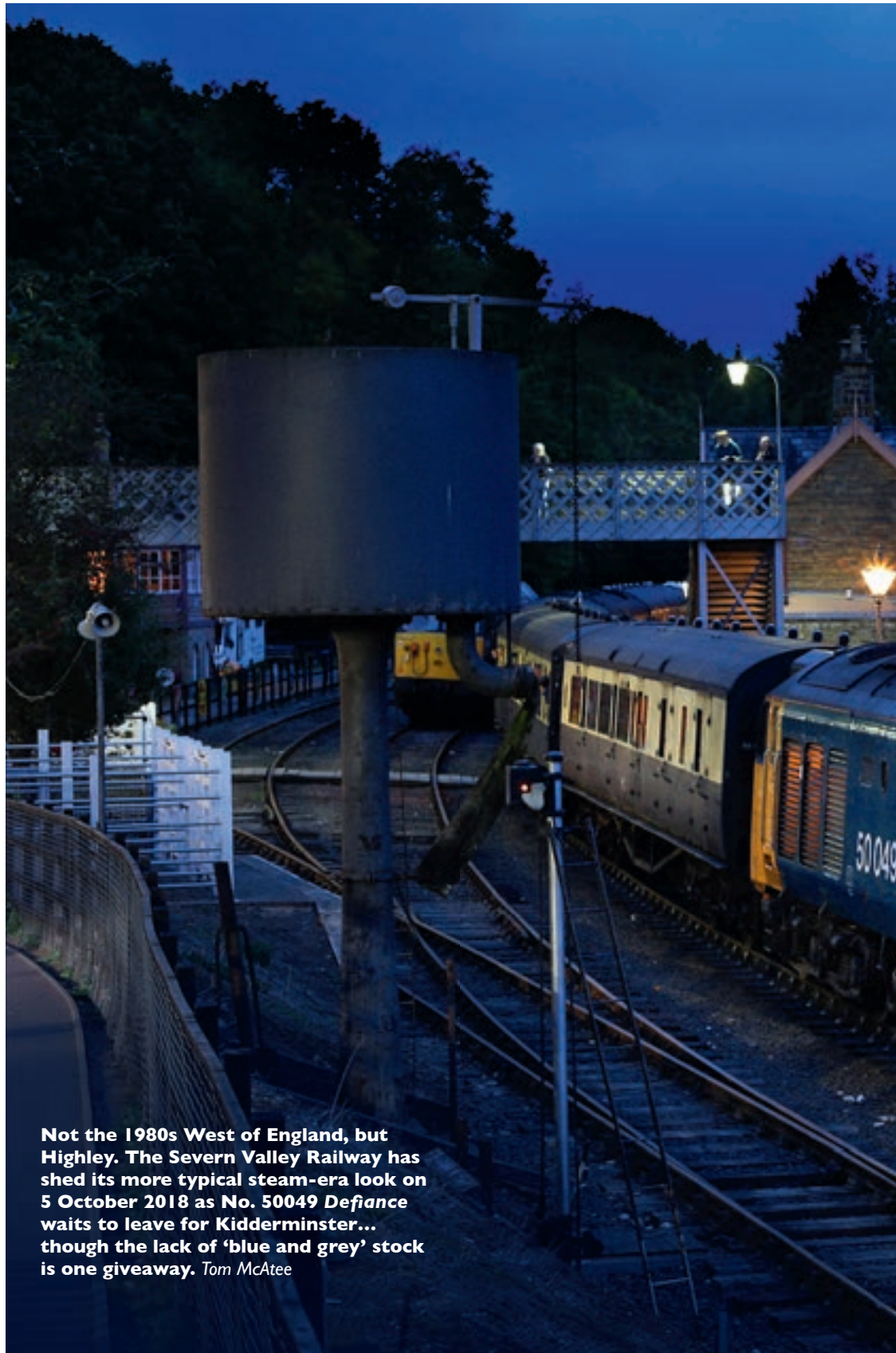
Not the 1980s West of England, but Highley. The Severn Valley Railway has shed its more typical steam-era look on 5 October 2018 as No. 50049 Defiance waits to leave for Kidderminster... though the lack of 'blue and grey' stock is one giveaway.

The C50A also has a share in the £1m purpose-built diesel Traction and Maintenance Depot (TMD) at Kidderminster that can perform all the tasks BR undertook on these locomotives at Crewe, Old Oak Common or Laira in the 1960s, 1970s and 1980s.