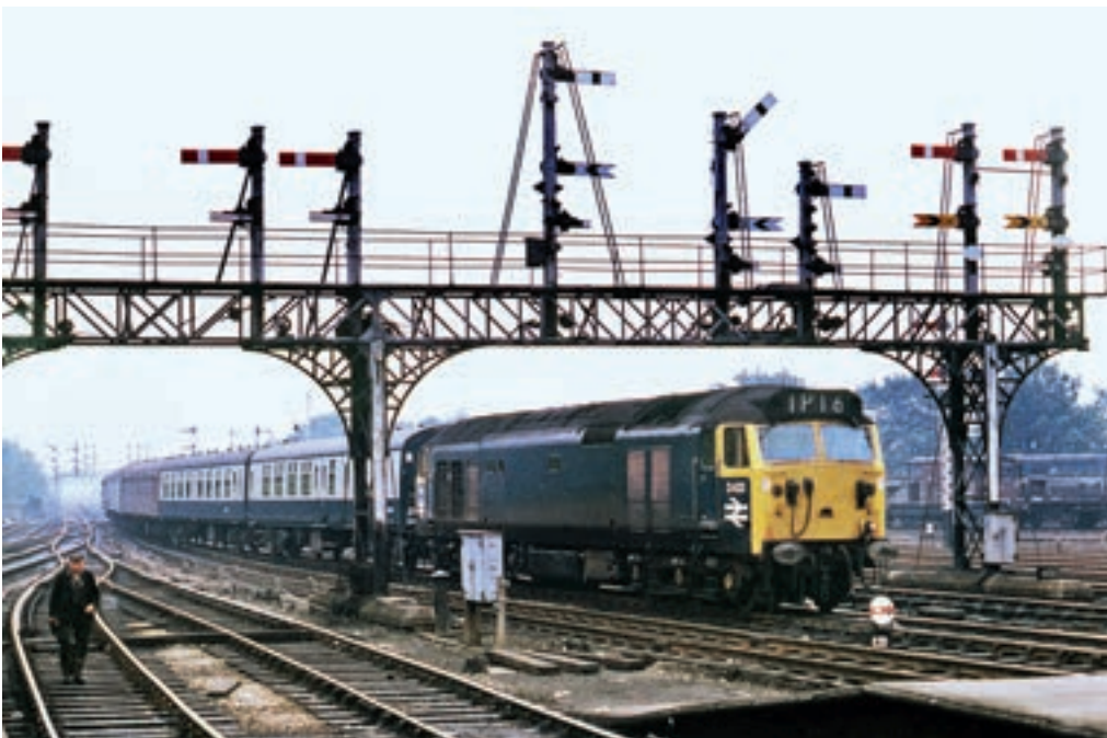
Early days on the West Coast Main Line: No. D433 – now No. 50033 Glorious – enters a very steam-age Preston on 8 July 1970. Electrification would soon change this scene, with the wires running all the way to Glasgow by 1974. Plus, what would today's health and safety say about the 'ganger' walking in the 'four-foot'... with no high-visibility vest?

They may be more modern than their coal-fired relatives, but even the '50s' have now been out of service for around three decades; Jon is now 52. Other C50A members are of a ➡