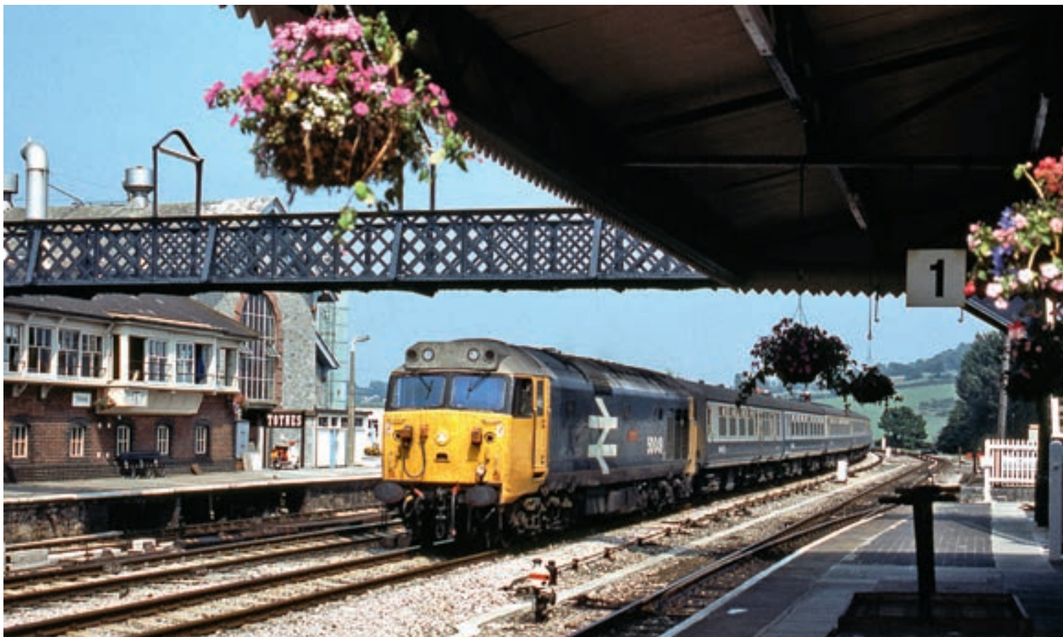
The Western of old. Flowers, a GWR-pattern platform trolley, even a mechanical ground signal greet Defiance as it sweeps through Totnes on 19 August 1984. The footbridge has since been replaced – it was hit by a crane in 1987, the same year the signalbox was taken out of use. Grade II-Listed, the latter is now a cafe. Behind the station running-in board, the stone building was intended as a pneumatic engine house for Brunel's atmospheric railway, but never used as such owing to abandonment of the vacuum system. Traditionally the junction for the Ashburton Branch, Totnes was used in the 1980s by the South Devon Railway, but the heritage line has since reverted to terminating at its own nearby Totnes (Riverside) station.