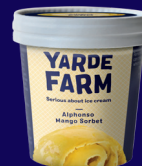
Alphonso Mango Sorbet