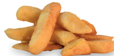
Boss Signature Thick Cut Chips (Ve) £3.99

Choose skinny fries or thick cut chips... ...then 'Boss it' with an optional extra upgrade!