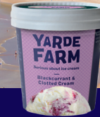
Blackcurrant & Clobbered Cream