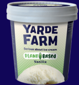
Plant Based Vanilla