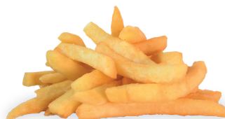
Skinny Fries (Ve) £2.99