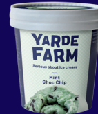
Mint Choc Chip