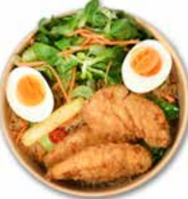
NASI GORENG WITH CHICKEN TENDERS