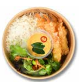
MASSAMAN CURRY SHOWN WITH TEMPURA PRAWNS