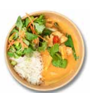
THAI RED CURRY SHOWN WITH CHICKEN AND VEGETABLES