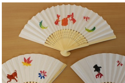
扇子作り Fan Painting Workshop