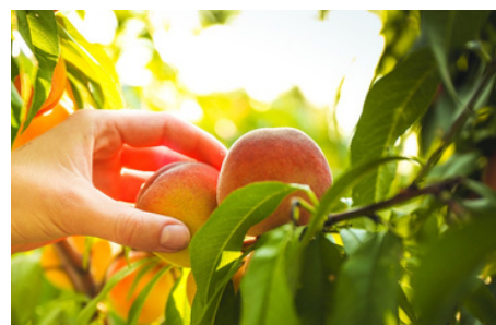
桃狩り Fruit Picking