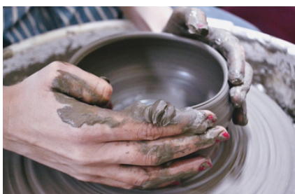
陶芸 Pottery Workshop