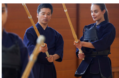
剣道 Kendo Experience