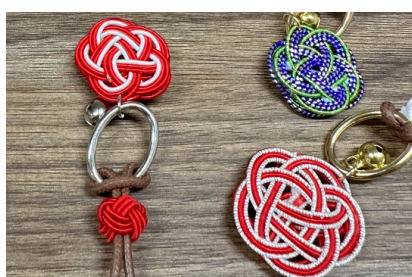
水引ワークショップ Mizuhiki Making