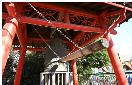
初詣 New Year Festival