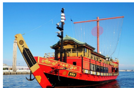
安宅丸 Samurai Ship