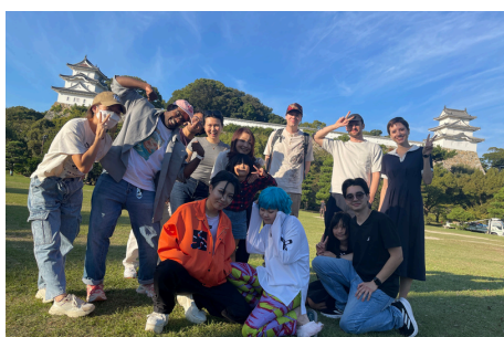
国際交流 Social Events with Locals