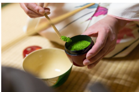
茶道 Tea Ceremony