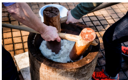
餅つき Mochi Making

**Minor changes in activities might happen