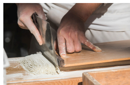
蕎麦作り Soba Making