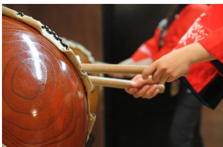
和太鼓 Wadaiko Drum Lesson