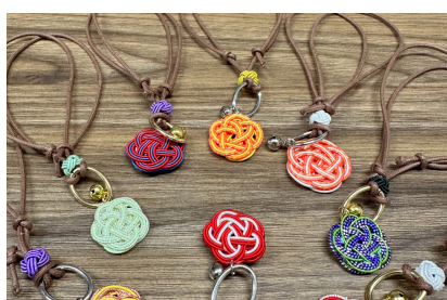
水引ワークショップ Mizuhiki Making