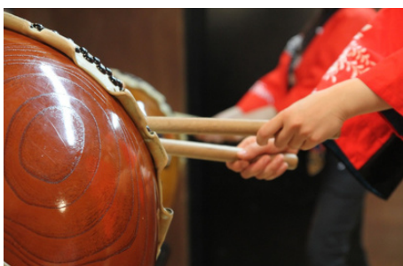
和太鼓 Wadaiko Drum Lesson