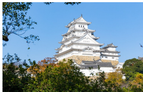
姫路城 UNESCO Castle Tour