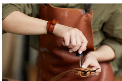
レザークラフト Leather Craft