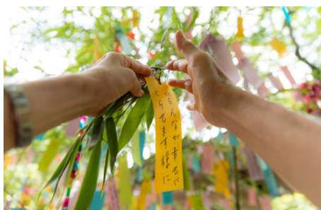
七夕 Tanabata Festival