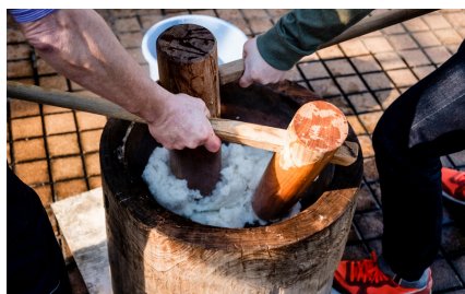
餅つき Mochi Making

**Minor changes in activities might happen