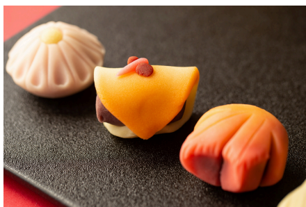
和菓子作り体験 Wagashi Making