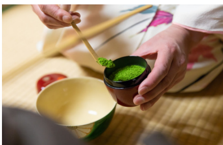
茶道 Tea Ceremony