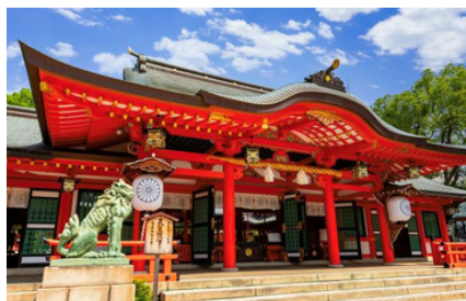
神社巡り Shrine Tour