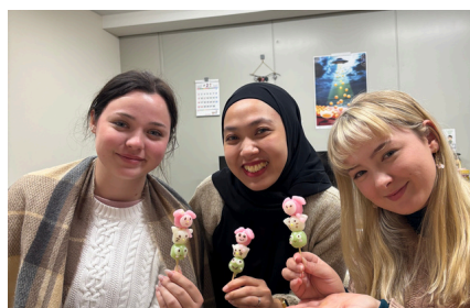
国際交流 Language Exchange