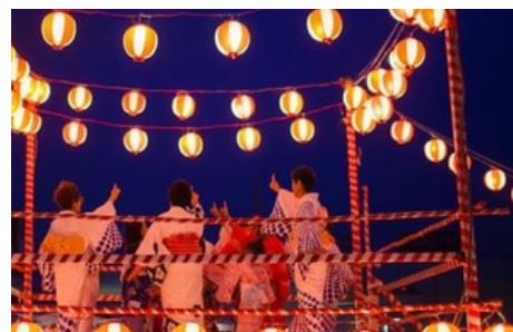
夏祭り Summer Festival