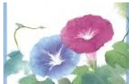
和紙コラージュ Washi Paper Art