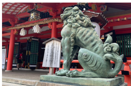
神社巡り Japanese Shrine Tour