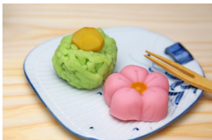
和菓子作り体験 Wagashi Sweets Making