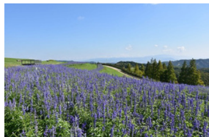
淡路島 Awaji Island