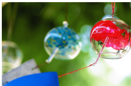
風鈴作り体験 Wind Chime Making