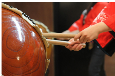
和太鼓 Wadaiko Drum Lesson