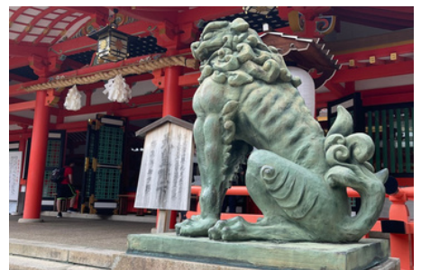
神社巡り Japanese Shrine Tour