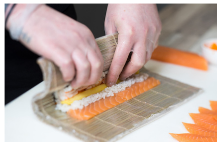
お寿司作り体験 Suhi Making