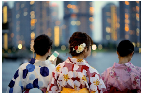
浴衣 Yukata Experience