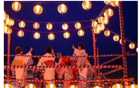
夏祭り Summer Festival