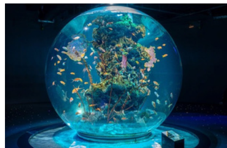
アトア Aquarium Art Museum