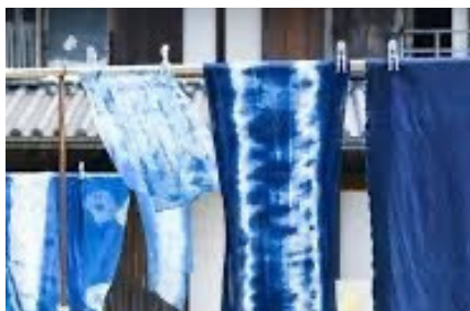
藍染 Aizome Dyeing