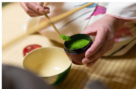
茶道 Tea Ceremony