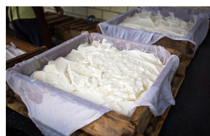
豆腐作り Tofu Making