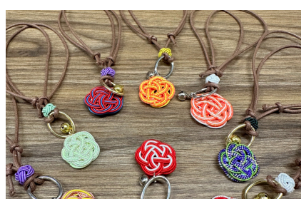
水引ワークショップ Mizuhiki Making