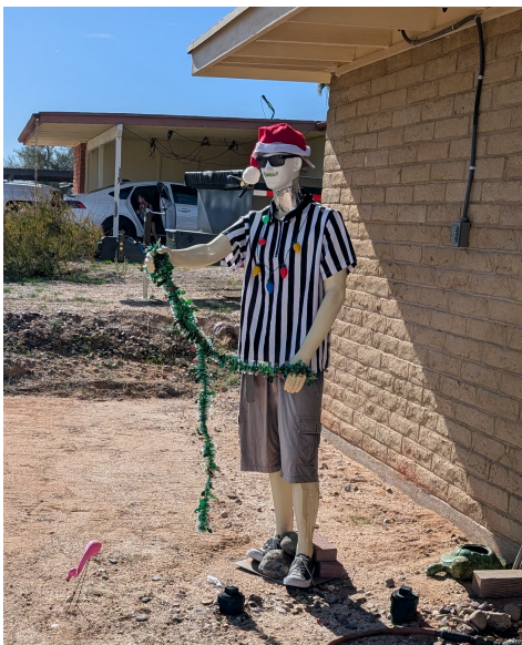
A member's Christmas yard decoration