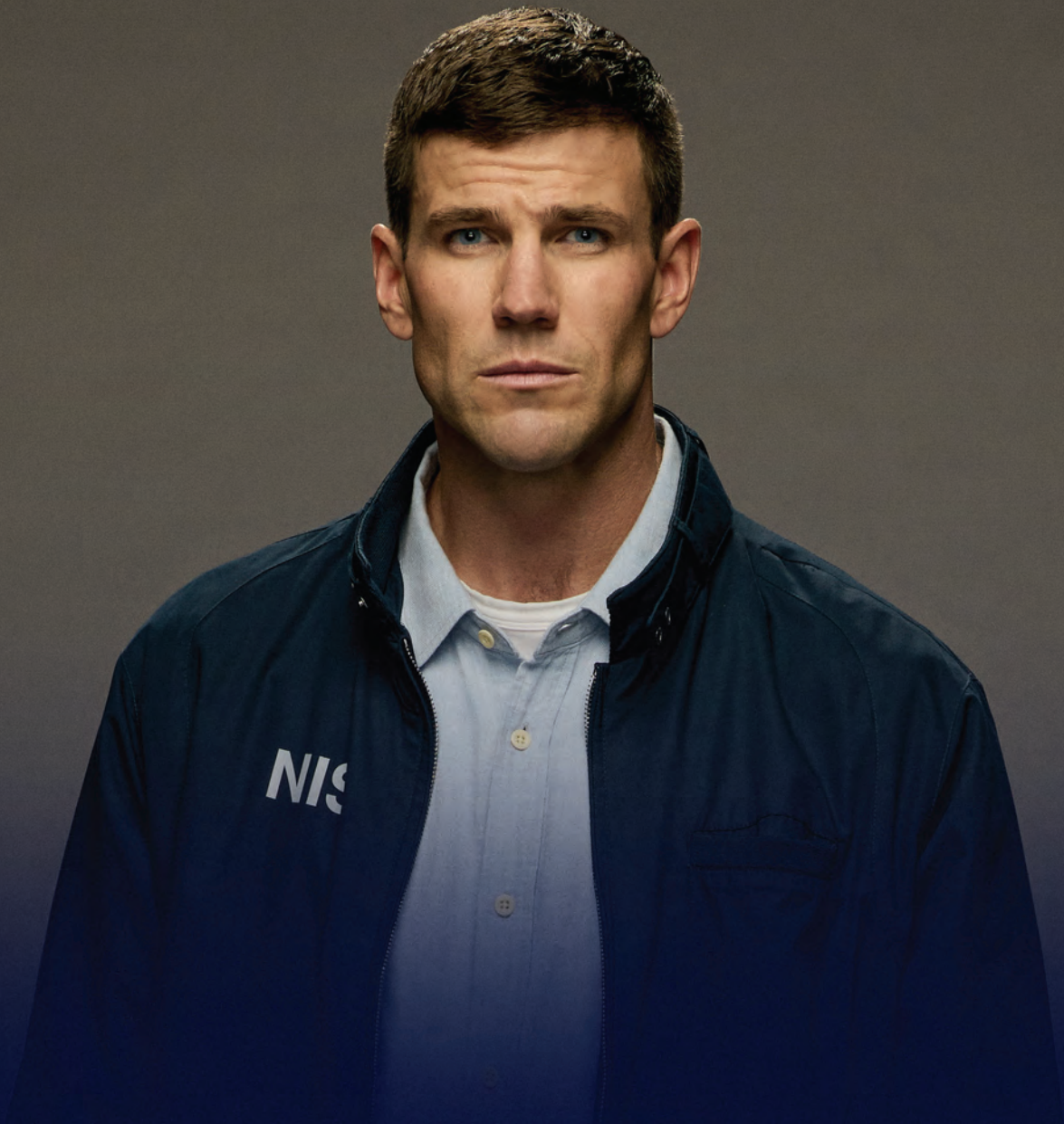
AUSTIN STOWELL NCIS: ORIGINS

CBS HONORS VETERANS THANK YOU FOR YOUR SERVICE