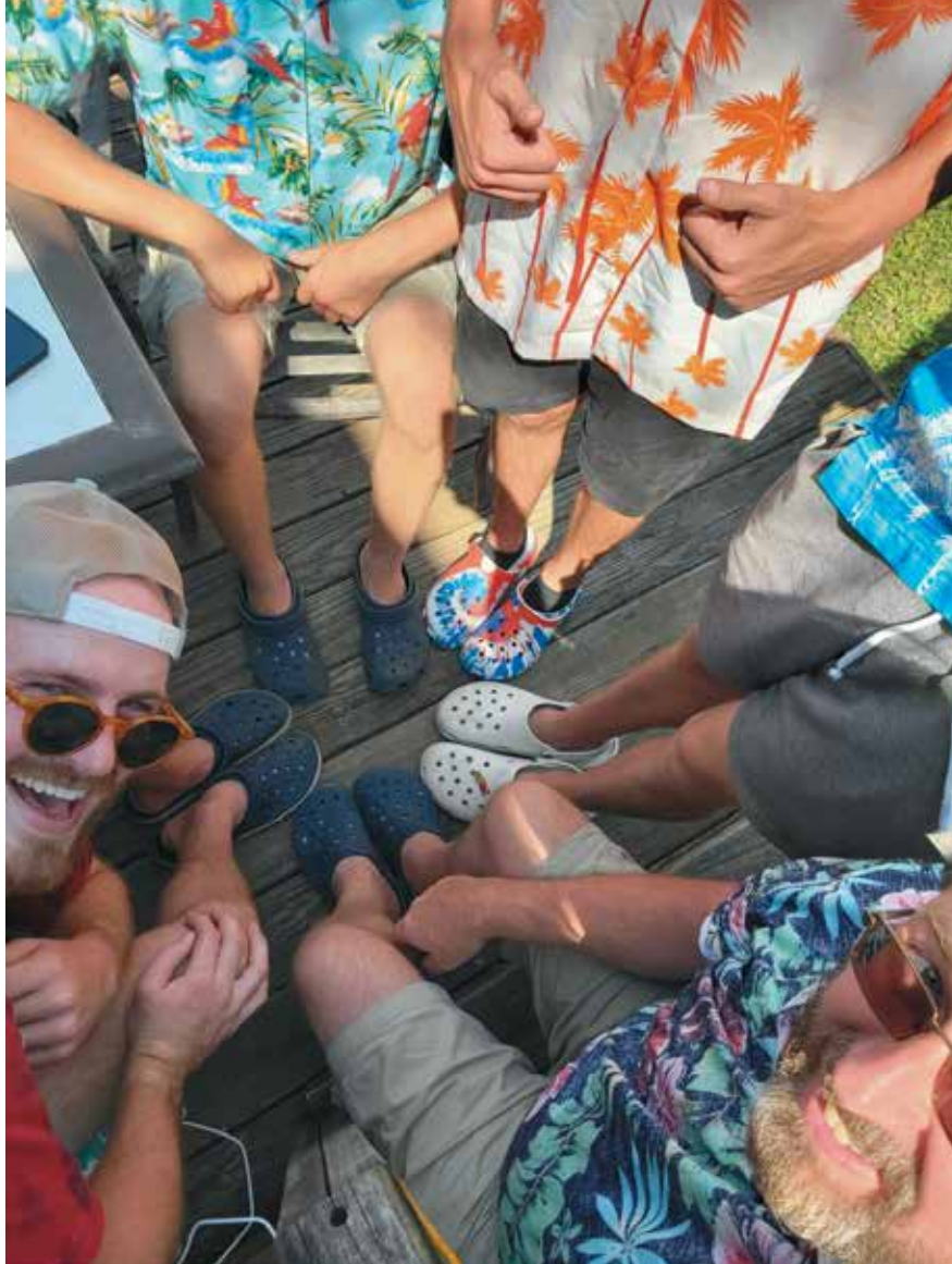
The Pool Guys show off their “uniforms.”

To help his team better understand older systems, how to repair them and