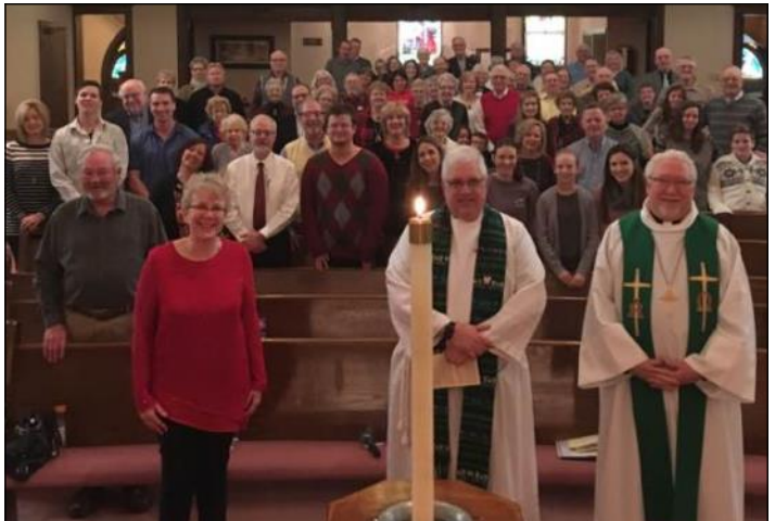
The special service was well-attended!