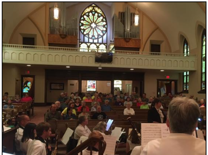
The view from the trombone section.

Thanks to everyone who pitched in to help!