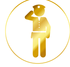
3 Tier Security