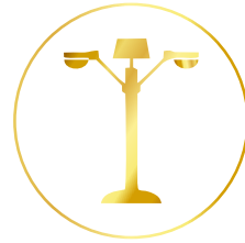
Solar Powered Street Lights