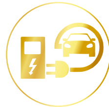
EV Charging Provisions