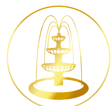
Designer Water Bodies