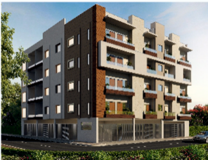
SHREE HOMES 1