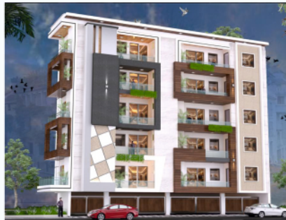
SHREE HOMES 2