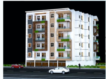
PARK VIEW APARTMENTS