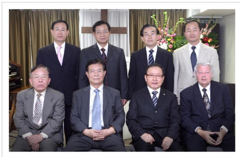
Founding members - October 4, 2008