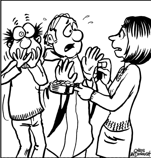
"We do NOT use breath freshener on the communicants!"