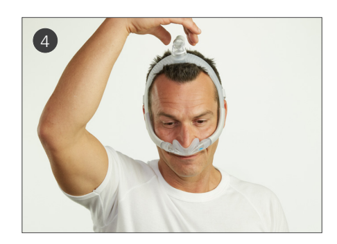
• Squeeze the side buttons on the elbow and detach from the frame.