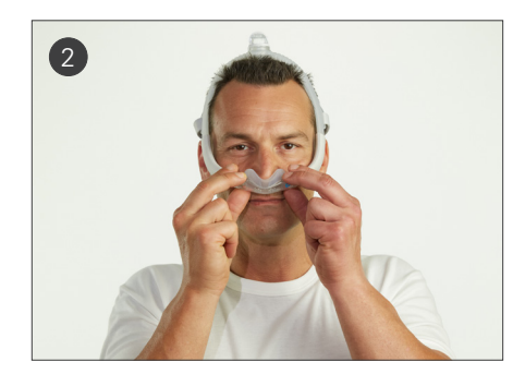
• Place the cushion under the nose.