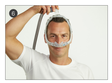
• Reattach the elbow to the frame. The mask is now ready to use.