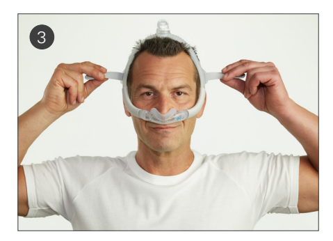
• Tighten or loosen the headgear until the cushion fits comfortably under the nose.