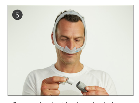
• Connect the air tubing from the device to the elbow.