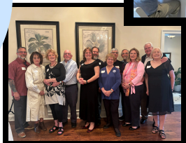
Our males members with spouses.