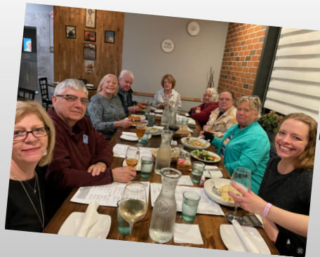
Third Thursday Members Cocktail