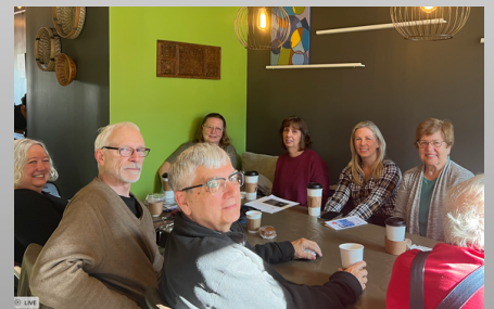
Third Friday Members Coffee