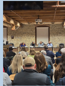
Batavia Candidate Forum, January 30, 2025. Library and School Board races.