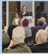
St. Charles Candidate Forum, January 29, 2025. Mayor and Alderman races.