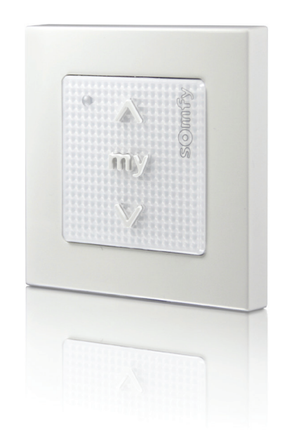
Smoove 1 RTS Pure Part #: 1811533

INTUITIVE, SURFACE-MOUNTED CONTROL FOR MOTORIZED WINDOW COVERINGS