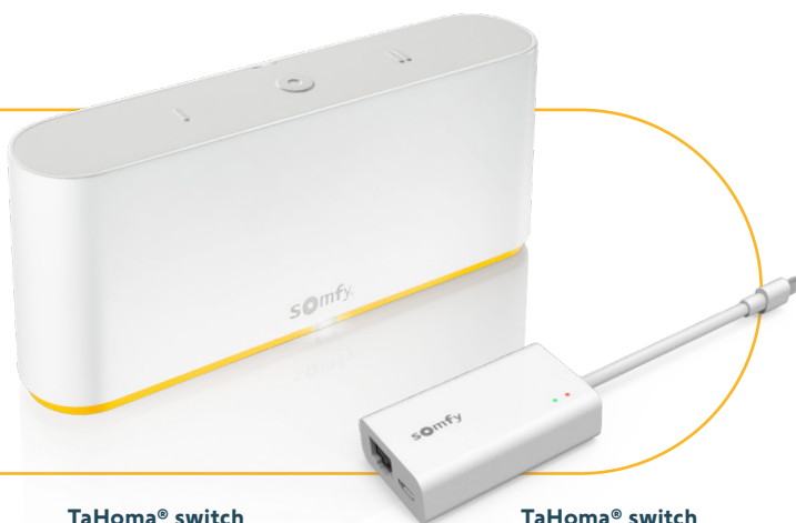
TaHoma® switch 1871037