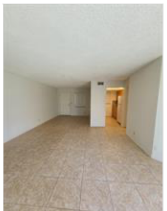
MLS #: R11009482