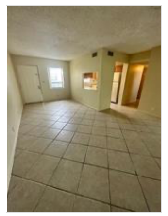
MLS #: A11622232