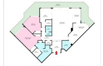
Floor Plan 1988 Condo Unit PLB 1183, West Palm Beach, FL 33409