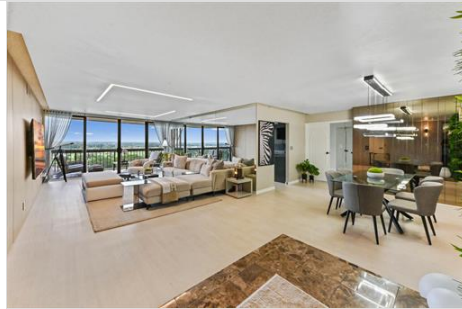
01 Living Room 01