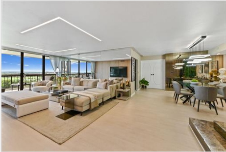
04 Living Room 04