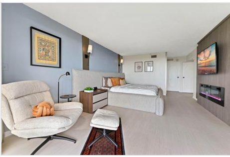
15 Bedroom 03