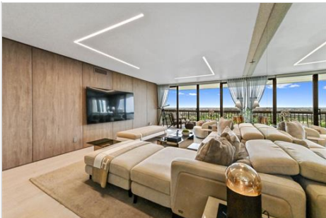
03 Living Room 03