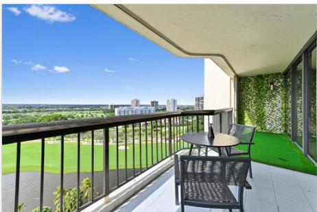
10 balcony 02