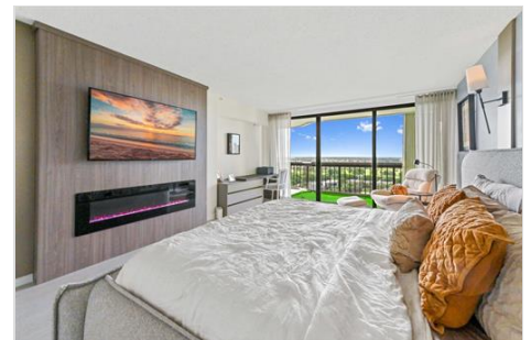
14 Bedroom 02