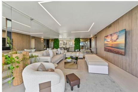
05 Living Room 058