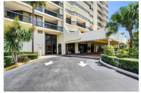
THE CONSULATE DRIVEWAY