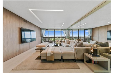
02 Living Room 02