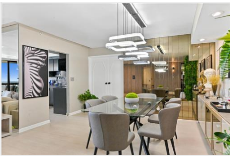
07 Dining Room 02