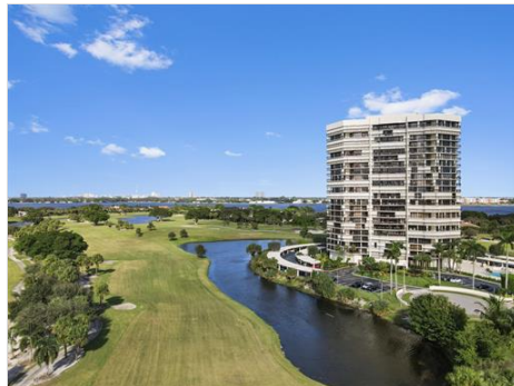
THE MAJESTIC CONSULATE BUILDING