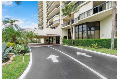
THE CONSULATE DRIVEWAY