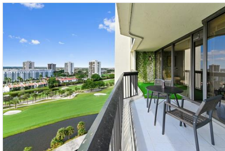
12 balcony 04