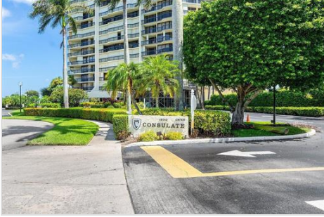
THE CONSULATE DRIVEWAY