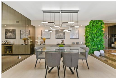
08 Dining Room 03