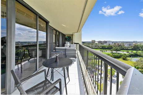
09 balcony 01