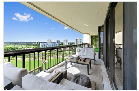
11 balcony 03