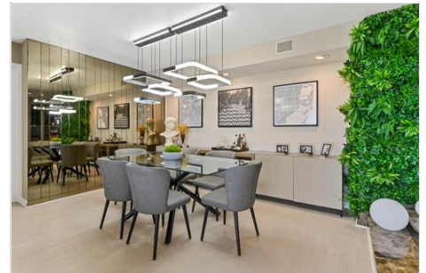
06 Dining Room 01