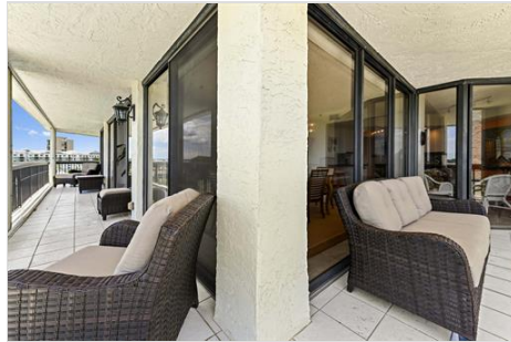
INCREDIBLE BALCONY SPACE