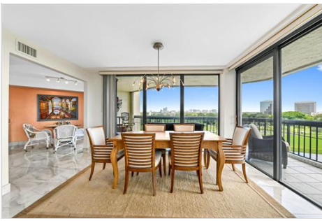
DINING AREA OPEN TO KITCHEN