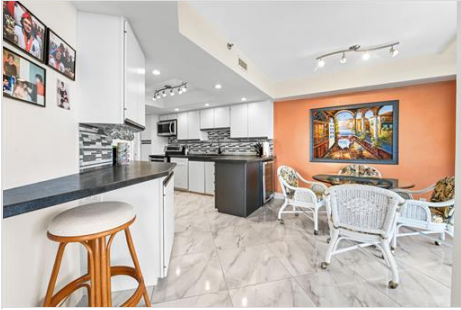
EAT IN KITCHEN