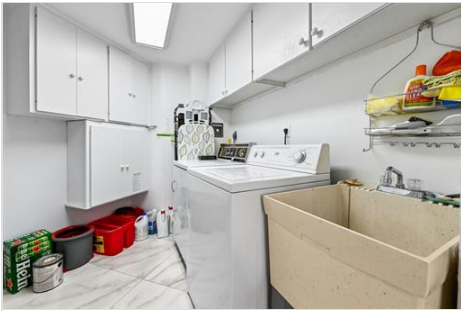
16 laundry room 01