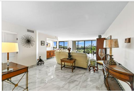
ENTRANCE TO LR