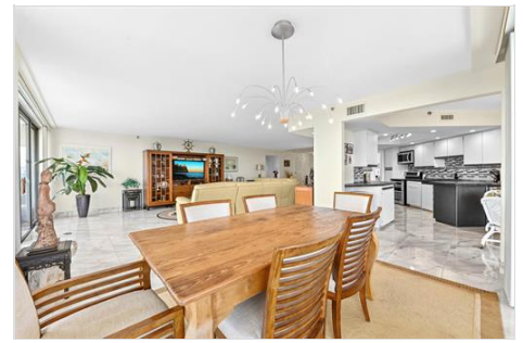
KITCHEN OPEN TO DINING AREA