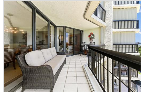
LOUNGING ON THE BALCONY