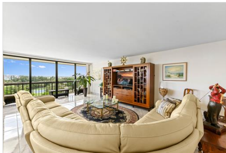
GREAT FOR ENTERTAINING