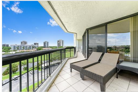
LOUNGING ON THE BALCONY