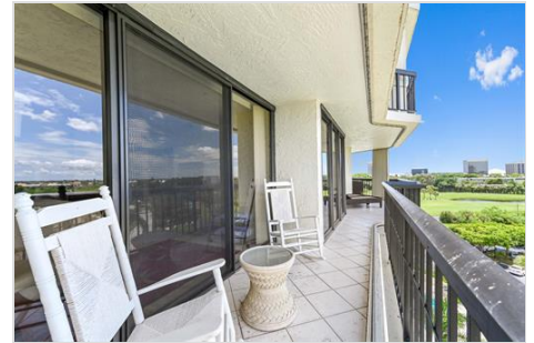
WRAP AROUND BALCONY