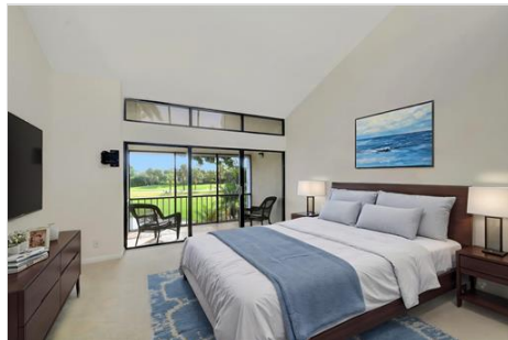
master bedroom staged