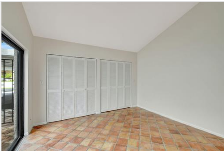
1st floor guest bedroom