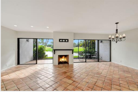
living room/dining room