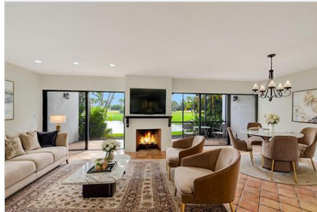
living room/dining room staged