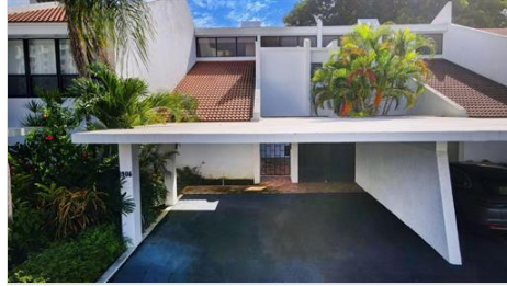
46-web-or-mls-Apartment air (1)