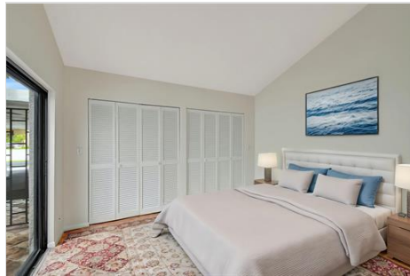
Virtual Staging AI - 19-web-or-mls-Apart