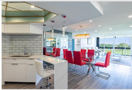
© Clark-2000 Presidential Way 501-001