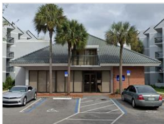
Clubhouse which is located in front of pool.