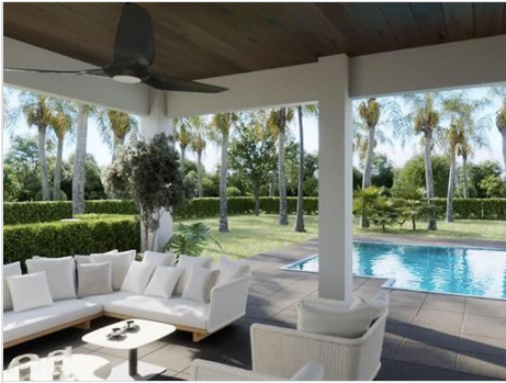
Outdoor covered loggia