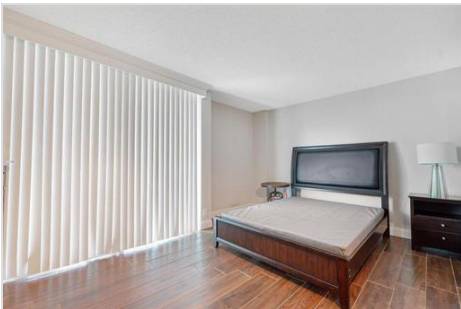
2 bed 3