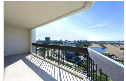
Big Balc 1