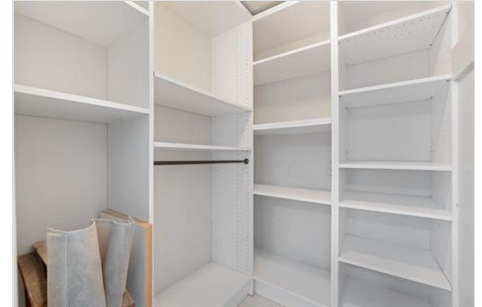
Master Closet 1