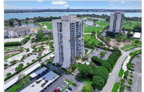
Over head 1