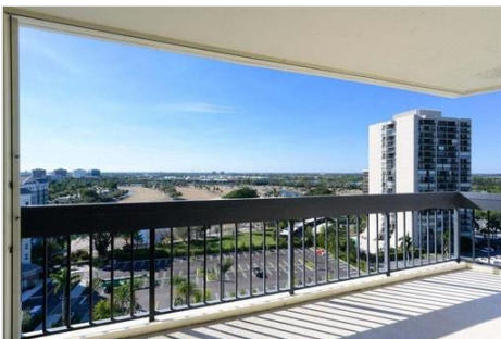
Big Balc 2