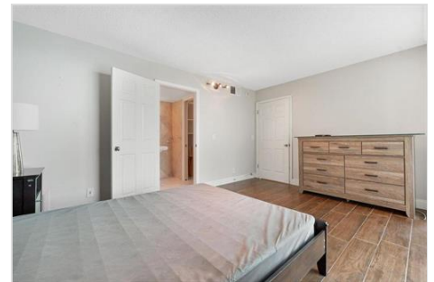
2 bed 2