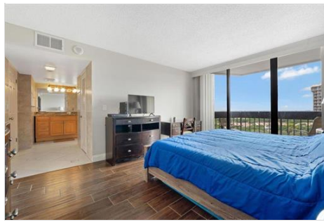
Master Bed 2