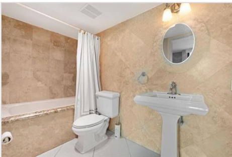
Master Bath 3