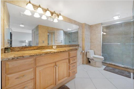
Master Bath 1