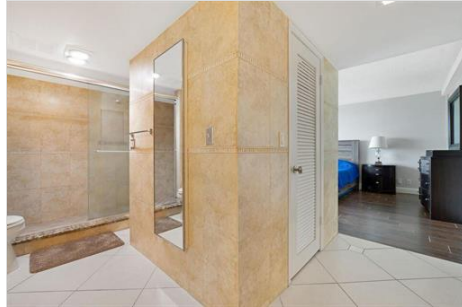
Master bath 2