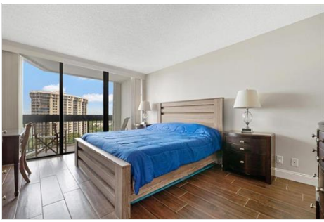
Master Bed 1