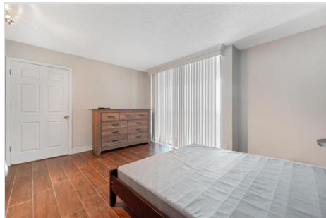
2 bed 4