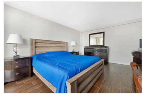
Master Bed 3