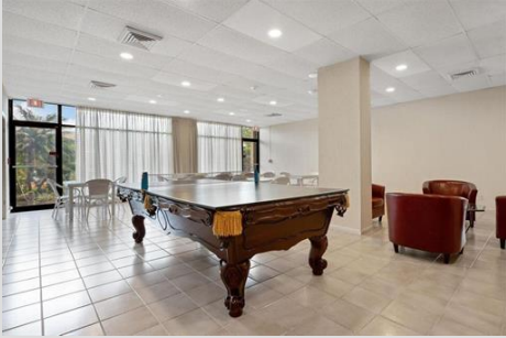
Rec Room 1