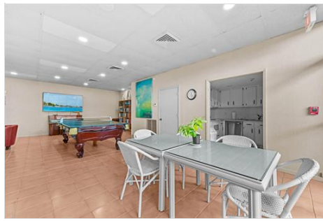
38 Clubhouse 04