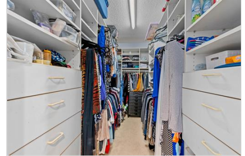
23 Closet 01