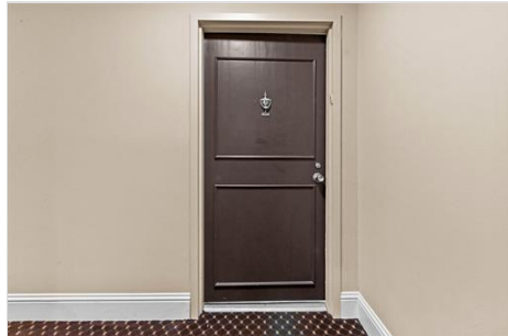
03 Entry 01