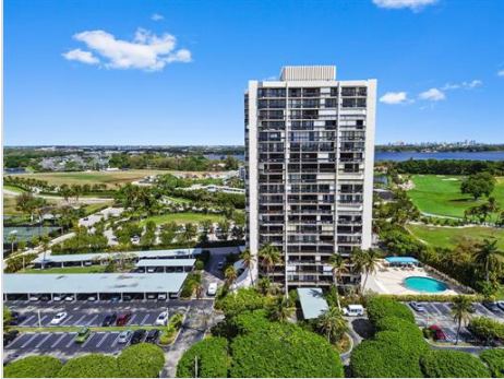
41 drone 02