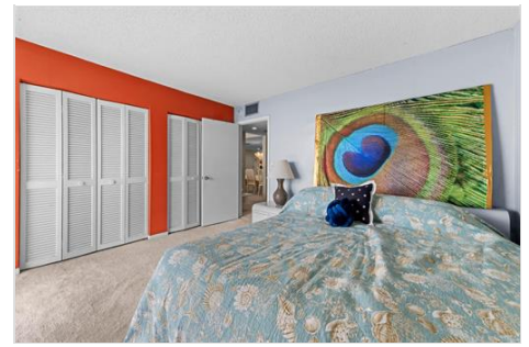
19 Bedroom 02