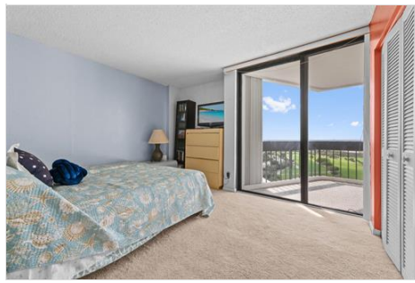
18 Bedroom 01