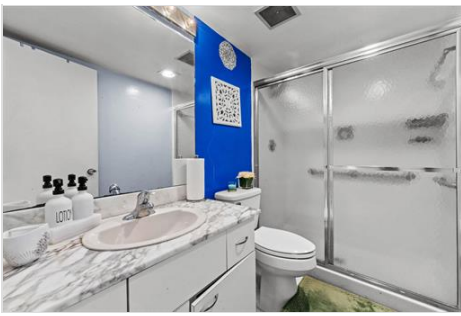
17 Bathroom 01