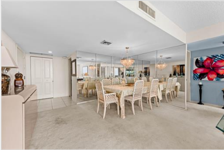
09 Dining room 02