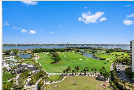
27 View 01