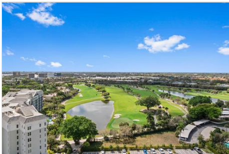
32 View 02