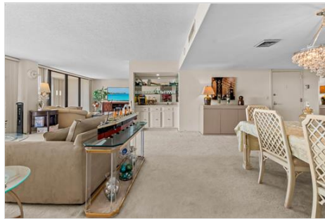
20 Living room 07