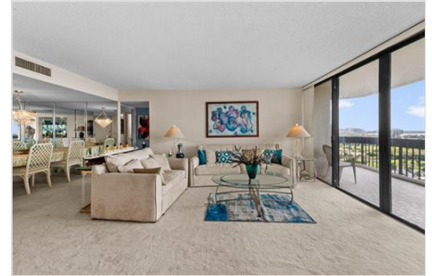
12 Living room 03