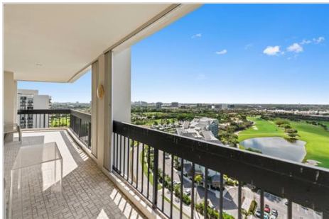
31 Balcony 05