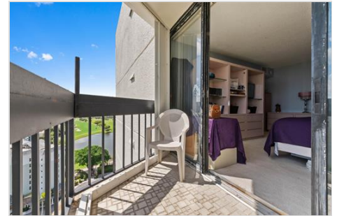
28 Balcony 02