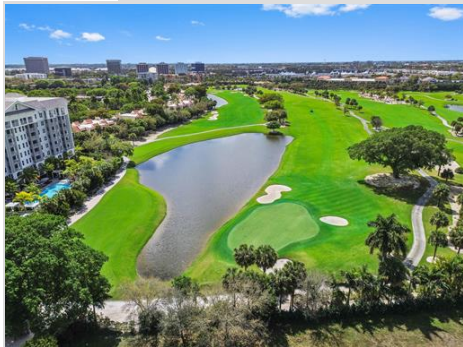
40 drone 01