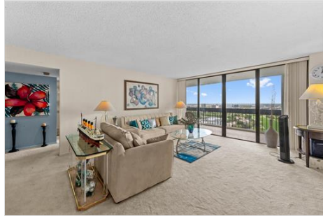
11 Living room 02