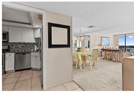
04 Entry 02