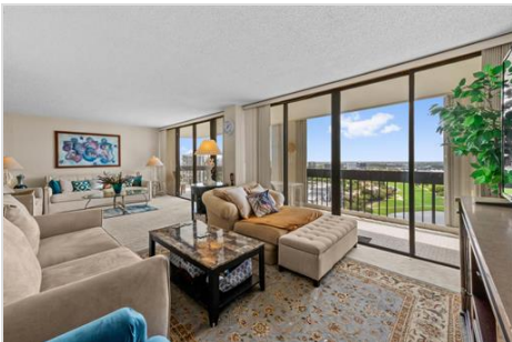
15 Living room 06