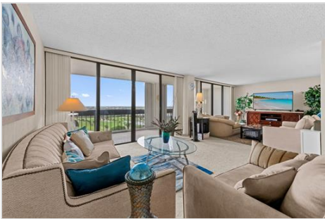
13 Living room 04