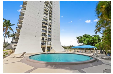
39 Pool 01