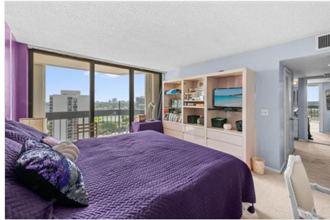
25 Bedroom 04