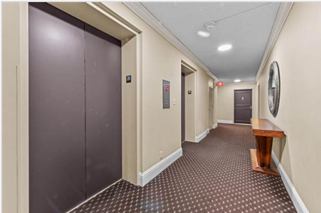
02 Elevator 01