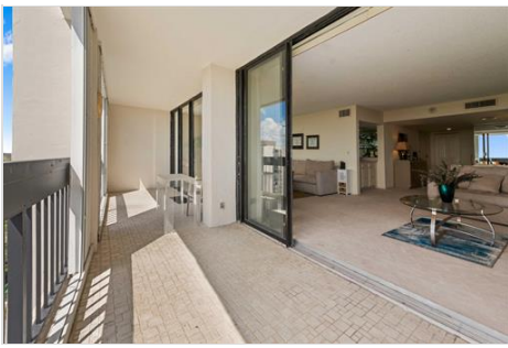
30 Balcony 04