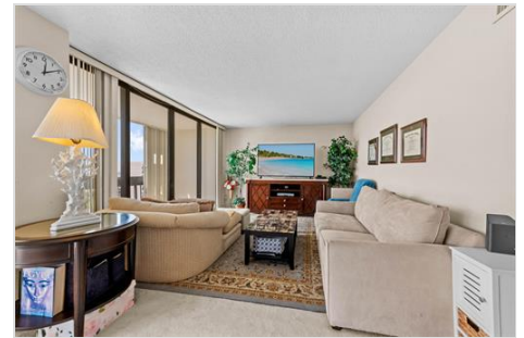
14 Living room 05