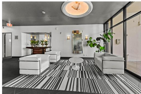
35 lobby 02