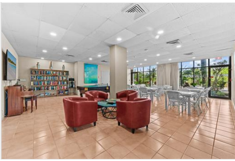
37 Clubhouse 03