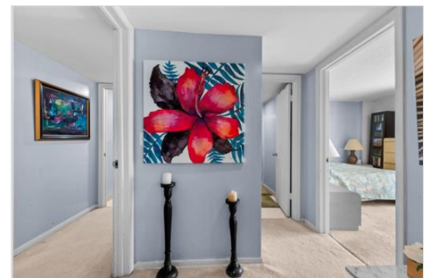
16 Hall 02