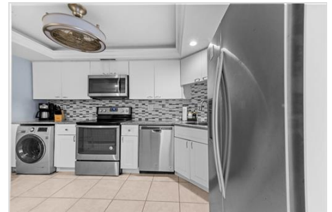
05 Kitchen 01