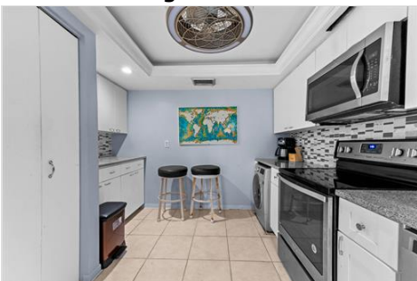
06 Kitchen 02