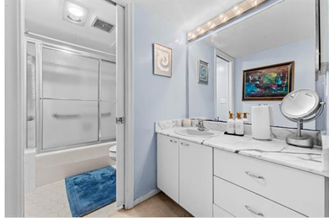
22 Bathroom 02