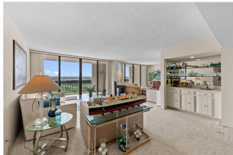
10 Living room 01