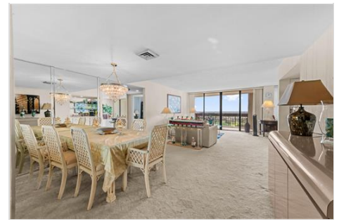
08 Dining room 01