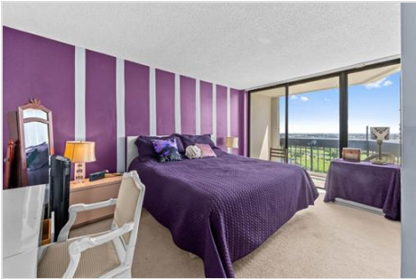
24 Bedroom 03