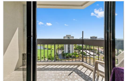
26 Balcony 01