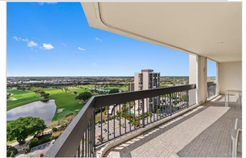
29 Balcony 03