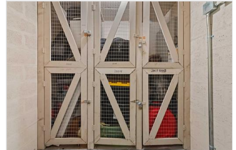
33 storage room 01