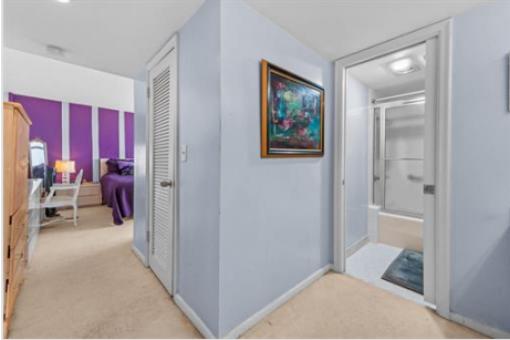
21 Hall 03