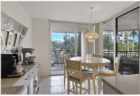
Eat- In Kitchen