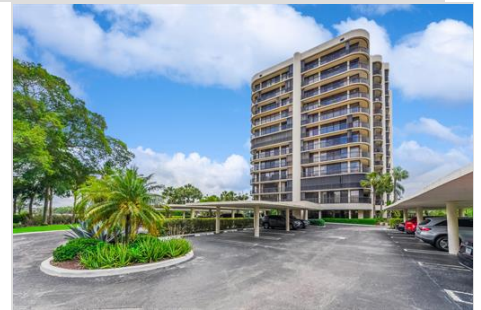
2427 Presidential Way