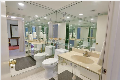
Half Bath/Powder Room