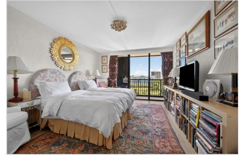
Bedroom # 2