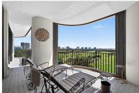
South view