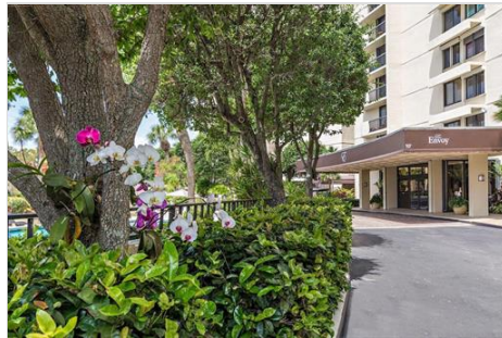
envoy 2022 entrance 2