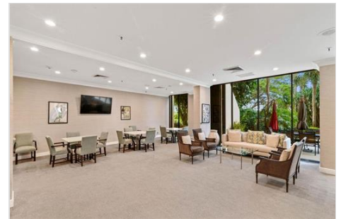
envoy north one 2