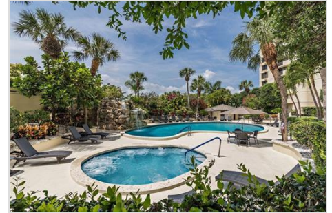
ENVOY WEB 6