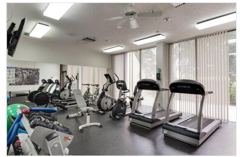
envoy 2022 exercise