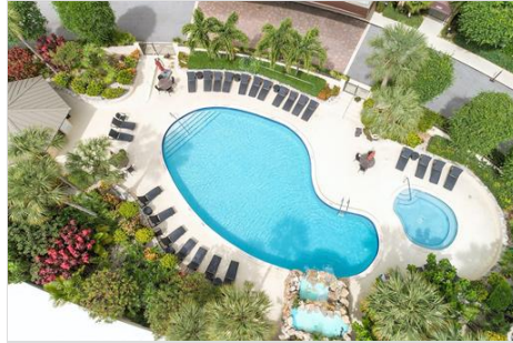
Envoy pool 2