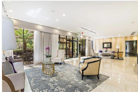
envoy 2022 lobby