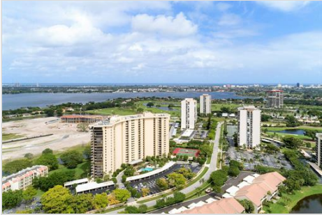
Envoy president 2