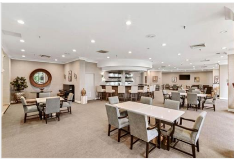
envoy north one