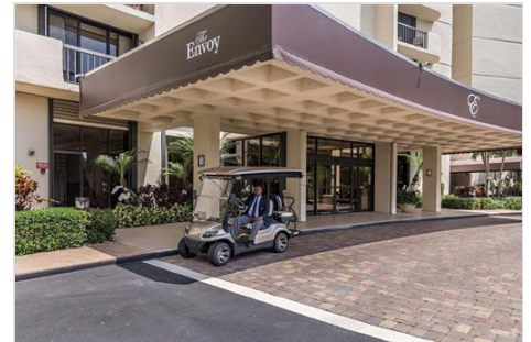
envoy 2022 entrance