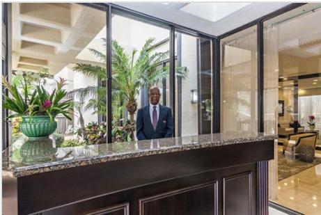
envoy 2022 desk