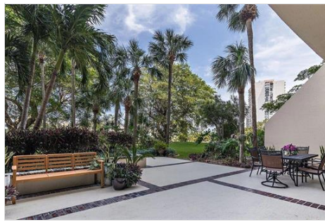
ENVOY WEB 4