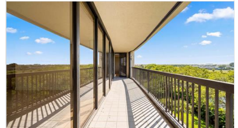
29-2480 Presidential Way 704