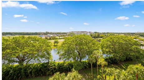
31-2480 Presidential Way 704