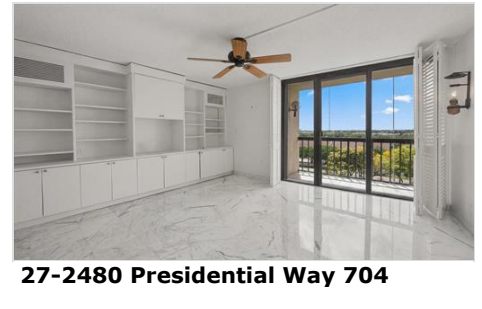
27-2480 Presidential Way 704