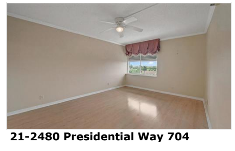
21-2480 Presidential Way 704