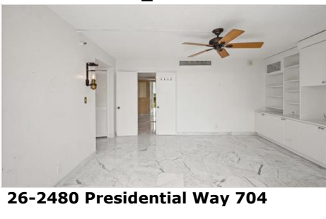
26-2480 Presidential Way 704