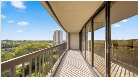
28-2480 Presidential Way 704