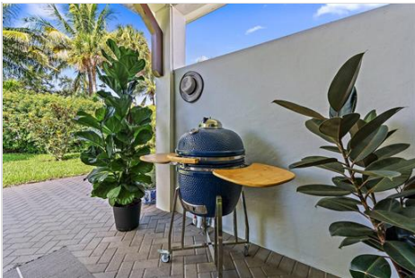
Covered Patio w/ BBQ