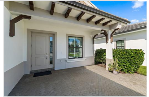
2908 Gin Berry Way