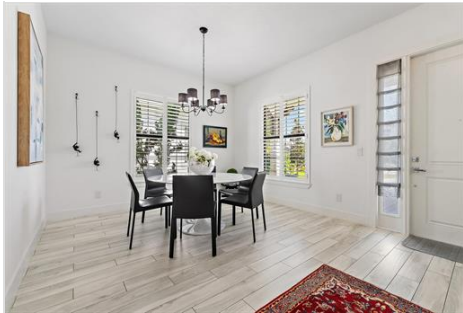
Entrance & Formal Dining