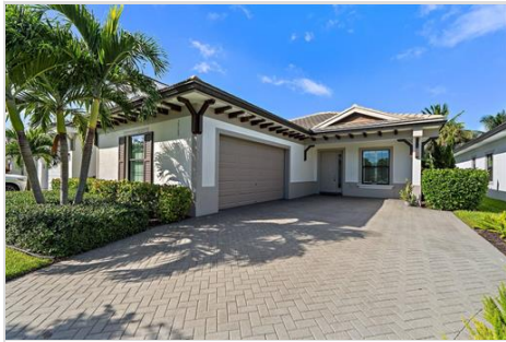
2908 Gin Berry Way