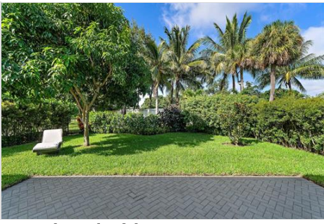
Backyard with Mango Tree