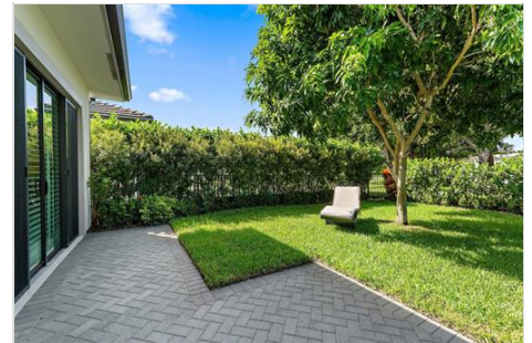
Backyard with Mango Tree