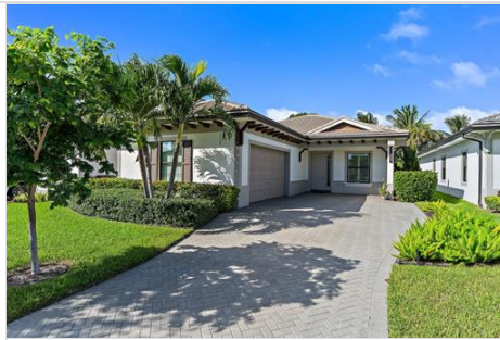
2908 Gin Berry Way