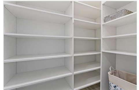
Closet in Den