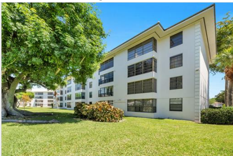
Back of building