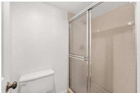
Primary bathroom shower