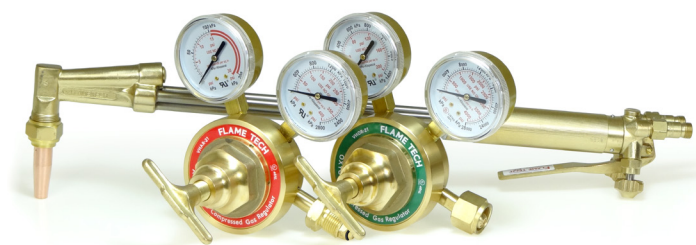
FTVHD-CK-F1 with 6321-F90