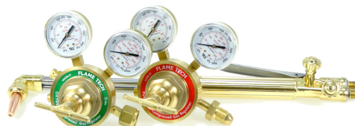
FTVHD921-CK-F1 with 921-90