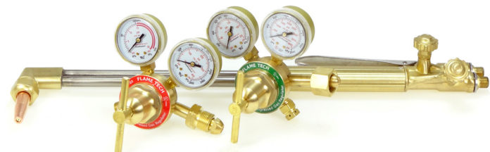
FTVMD26-CK-A1 with 2621-90