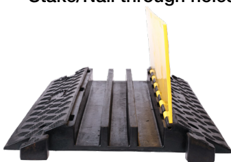
3 Channel Linear 31205-1