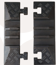
3 Channel End Cap 31208-1

BUILT FOR DURABILITY. BUILT FOR RELIABILITY. BUILT FOR WORK.™