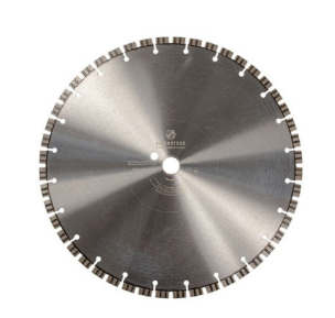
16" Premium Diamond Cutting Disc Order no. 3744T000